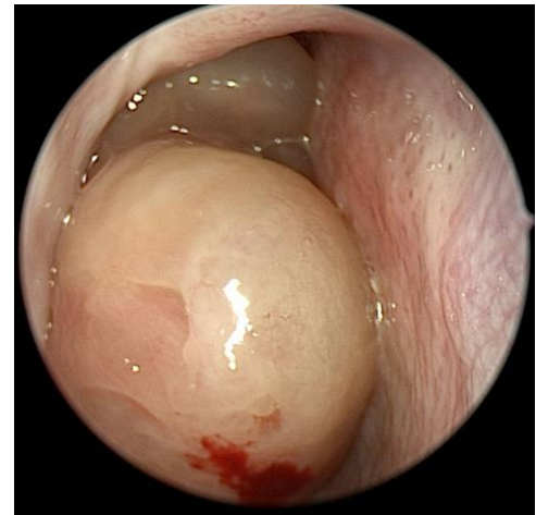
Figure 1. Nasal polyps

Doctors will perform an exam using a small camera to look inside the nose (See Nasal Endoscopy). Your doctor may also order a special X-ray called a CT scan to evaluate all the sinuses.