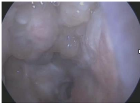
Figure 2. Endoscopic view of recurrent polyps in a patient who had limited sinus surgery/polypectomy

No. They are not. It is important to realize that limited surgery and balloon sinus dilatation may not provide large enough openings for delivery of topical nasal medicines designed to keep nasal polyps from re-growing. Prior surgery, the presence of nasal polyps, severe allergy issues including allergy to aspirin, and other complicated medical problems all can make sinus surgery more difficult. Every individual is different. Surgical approaches are altered according to the needs of each patient.