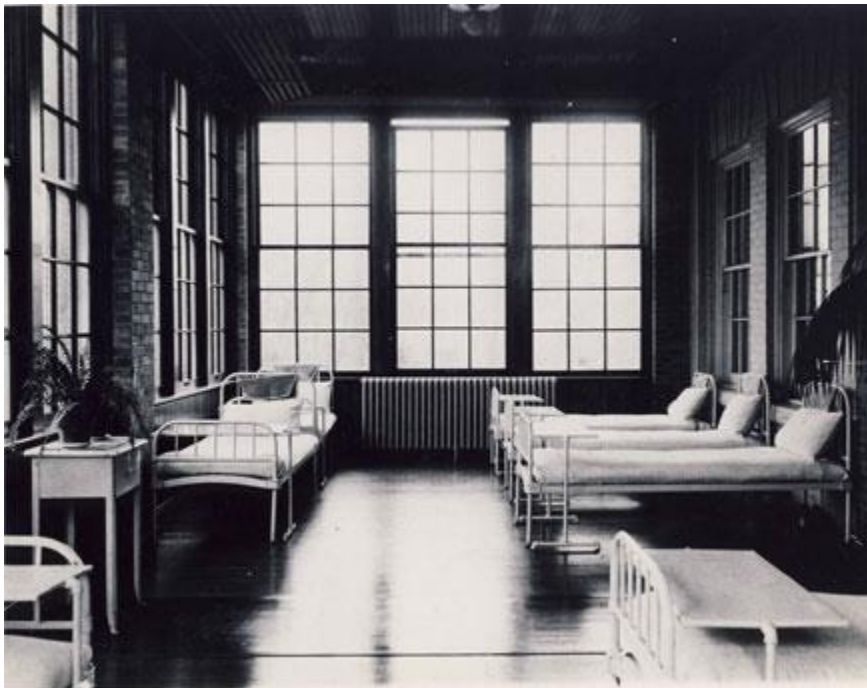
As overcrowding became an issue in the 1930s at the Highbury site, sunrooms were converted into patient bedrooms.

Though treatment of mental illness continued to develop, the 1930s saw the highest number of patients in the facility at 1700.