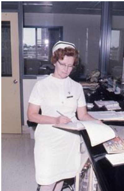
As treatments changed, nurses adapted methods to ensure modern care practices.

In 2001 St. Joseph's Health Care London took over governance of the London Psychiatric Hospital and its name changed to Regional Mental Health Care London. This era was especially tied to change as mental health transformation began to take shape, including plans to build a new facility.