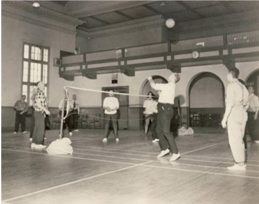
Staff and patients partake in a friendly game of volleyball in the recreation hall of the Highbury site. Patients enjoyed many activities through the years including dances, picnics, gardening and drop-in centres.

this time that many changes to mental health care were developed, including new therapies, programs and advancements to medications.