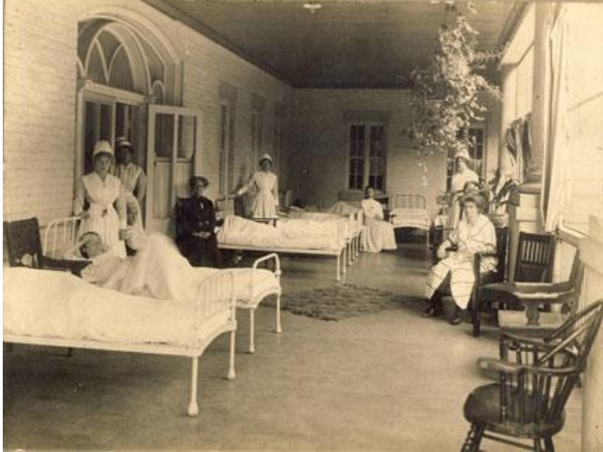
Open air bedrooms were part of the therapy used in the early years at the Highbury site.

Though treatment of mental illness continued to develop, the 1930s saw the highest number of patients in the facility at 1700.