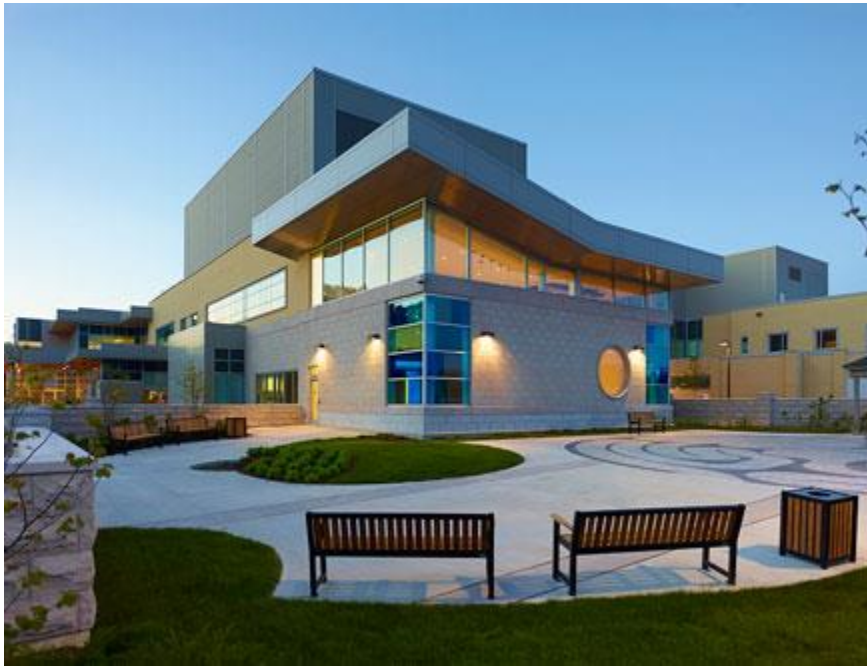
The award winning Southwest Centre for Forensic Mental Health Care*

St. Joseph's Southwest Centre for Forensic Mental Health Care received the 2014 International Mental Health Design award, presented by the International Academy for Design and Health.