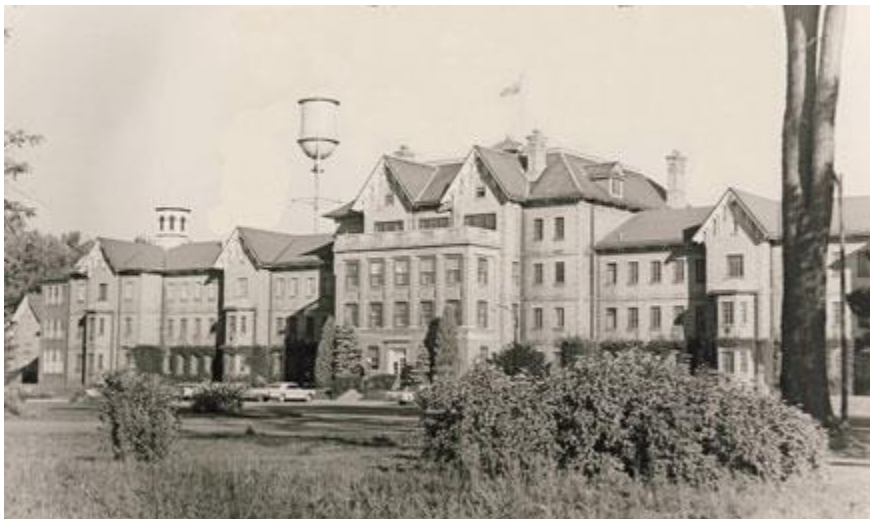
The London Asylum for the Insane was instantly at capacity with 500 patients when it was opened in 1870.

With a building cost of $100,000, the London Asylum for the Insane (LAI) opened in November 1870. The facility became part of a widespread movement across North America to create specialized institutions for the mentally ill.