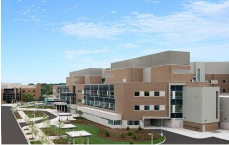
With 156 individual patient rooms and 460,578 square feet of specially designed therapeutic space, the new St. Joseph's new Mental Health Care Building will make a marked difference for patients, families and care providers.