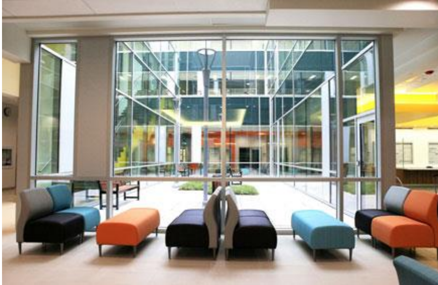
Interior courtyards allow for abundance of natural light and for the sun, rain and snow to be visible through the seasons from inside the core of the facility.