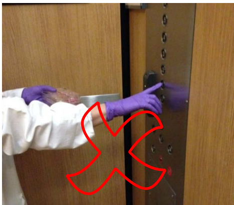
Incorrect: gloved hand touching elevator buttons

Best lab safety practice is to place the material in secondary containment to allow handling of the outer package without gloves and to contain the material if it were dropped.