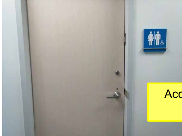
Accessible washrooms are fitted with wide doors and identified with symbols and braille signage.