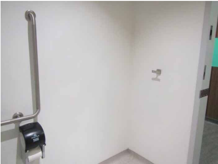
Accessible washrooms are fitted with accessible sinks and grab bars; coat hooks and waste bins are placed at heights that allow easy reach for those using scooters and wheelchairs.