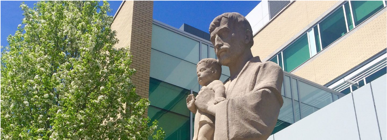
Statue of Saint Joseph at St. Joseph's Hospital

St. Joseph's reported strong financial results for 2021/22 as we continued to weather the impact of COVID-19 on our organization and our community.