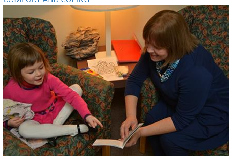
In St. Joseph's Palliative Care Unit, new activity kits are helping children deal with impending loss of a loved one

A new resource kit is helping children work through their grief when someone significant in their lives is near the end of life in the Palliative Care Unit at Parkwood Institute.