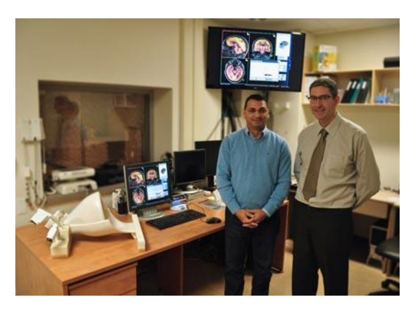
The unique London-based coil product is now being sought worldwide

Scientists at Lawson Health Research Institute, in collaboration with Ceresensa Inc., have produced the world's first commercial imaging product for PET/MRI scanners. The novel head coil provides unparalleled images to advance the study, diagnosis and treatment of a wide range of diseases. This research innovation comes after Lawson installed Canada's first whole body PET/MRI scanner in 2012 at St. Joseph's Hospital. This hybrid imaging scanner combines magnetic resonance imaging (MRI) and positron emission tomography (PET) into one powerful and simultaneous whole-body system, with substantial and innovative results. Patient diagnosis is faster and overall information available from the scan is better and more detailed.